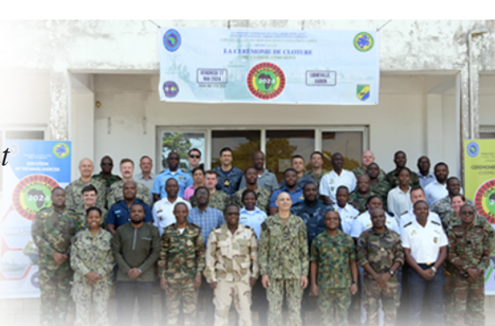
Leaders working together to promote enduring partnerships.

Enduring U.S. Partnerships The USG retains the ability to engage and operate throughout Africa through a whole-of-government approach that supports the mutual benefit of our African Partners, our Allies, and the United States.