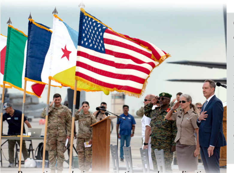
Promoting enduring connections and coordination across the African continent.

We will remain connected across Africa with our African Partners and our Allies. Our security relationships necessitate enduring presence, shared responsibility, transparent communication of goals and interests, and the interoperability of security infrastructure. The decisive advantage over our competitors is our enduring network of African Partners and Allies.