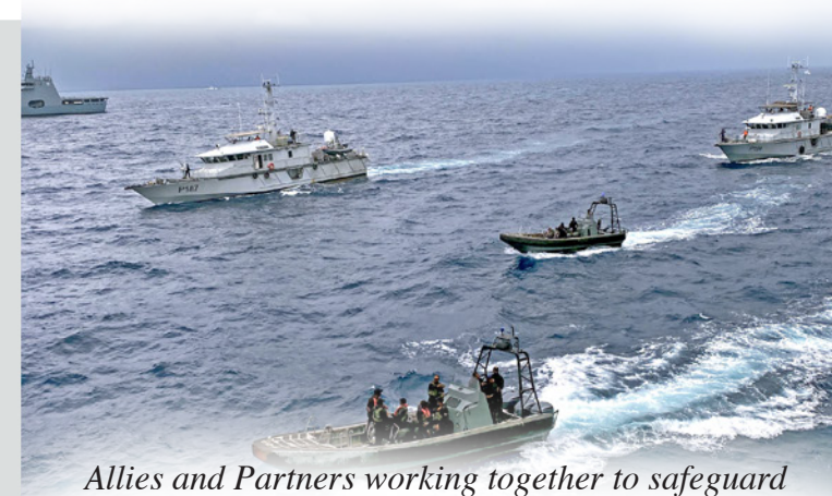
shared security interests.

With African Partners and Allies at the center of this effort, we will expose, disrupt, and when necessary, counter threats to regional and continental stability. We will safeguard shared security interests to promote and protect a thriving, transparent, and just international system that can overcome VEO, TCO, and malign influence throughout the African continent.