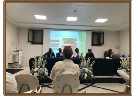
Ghanaian delegation presents overview of domestic laws authorizing security operations.