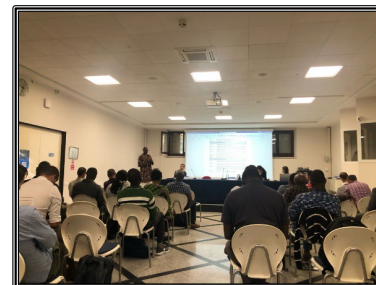
Small group presenting work.

exercise with too much contextual information. He recommended replacing country names with Red and Blue to avoid referring to host nation laws. But another planner, who participated in the working group, pointed out that this complexity is exactly what FLINTLOCK