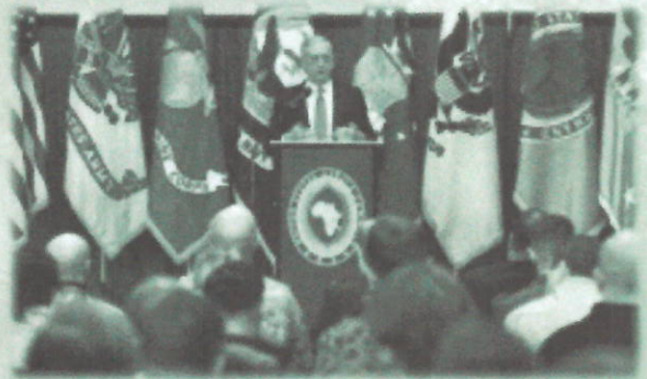
Secretary of Defense, James Mattis addressing USAFRICOM in Stuttgart.

Africa's security challenges cannot be resolved through the use of military force as the primary agent of change. Therefore, our most important strategic theme is that USAFRICOM directly supports U.S. diplomatic and developmental efforts in Africa. While the DoS is the lead for setting foreign policy and USAID is the lead agency responsible for international development and humanitarian assistance, USAFRICOM supports their policies and programs with unique security related capabilities.