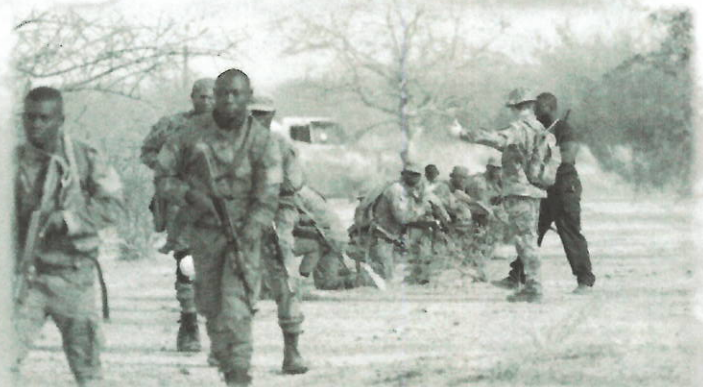
Exercise Flintlock, a multi-national exercise to develop capacity and collaboration between security forces to protect civilian populations.

African Partners Contribute to Regional Security. Building partner capability is the primary strategic effort. USAFRICOM will work by, with, and through partners to help Africans develop capabilities that address drivers of instability. Security cooperation enables partners to meet a broad range of security requirements from humanitarian assistance and disaster relief to counter-terrorism operations. USAFRICOM will use a comprehensive and whole-of-government approach to leverage a diverse set of security cooperation resources. Institutional capacity will be enhanced through a variety of means, such as the Department of Defense State Partnership Program. USAFRICOM will distribute efforts between fragile states and those that are relatively stable and strong. Strategic investment in the latter has a greater chance of fostering regional security, potentially reducing the need for costly future U.S. interventions.