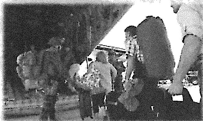
U.S. Embassy in Juba being temporarily evacuated in 2014 to protect U.S. personnel.

USAFRICOM will align its forces, authorities, capabilities, footprints, and agreements to conduct day-to-day activities, respond to crises, and execute contingency operations. To reflect changes in the operational environment, USAFRICOM will continually monitor, assess, and adjust its posture. Set-the-theater efforts will also focus on gaining a shared situational awareness with neighboring combatant commands and regional partners.