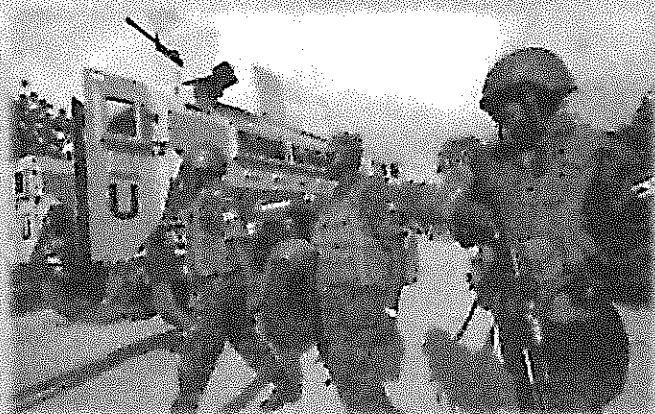
African Union forces in support of Peace Keeping operations.