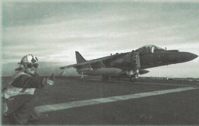
Kinetic strikes being launched from USS Wasp, targeting terrorists in North Africa.

Threats From VEOs and TCOs are Reduced. VEOs in Africa principally threaten and disrupt African partners and their economies, but they also threaten U.S. interests and citizens on the continent. The command will leverage a wide range of means, from unilateral operations to security cooperation, to enhance African partners' efforts to defeat VEOs. Activities aimed at degrading VEO capability and capacity have yielded positive results. This underscores that persistent pressure on VEO and TCO networks can prevent them from becoming transnational strategic risks.